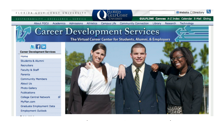
Career Development Services website

Over 100,000 visitors and 600,000 page views each year